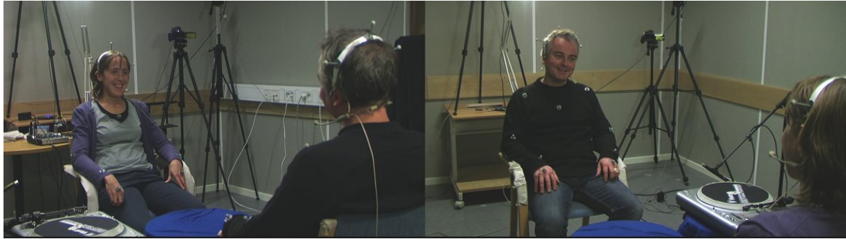
Figure 1. Example showing one frame from the two video cameras taken from the Spontal database.

in the session, including meta-comments on the recording environment and suchlike, with the intention to relieve subjects from feeling forced to behave in any particular manner. The recordings are formally divided into three 10 minute blocks, although the conversation is allowed to continue seamlessly over the blocks, with the exception that subjects are informed, briefly, about the time after each 10 minute block. After 20 minutes, they are also asked to open a wooden box which has been placed on the floor beneath them prior to the recording. The box contains objects whose identity or function is not immediately obvious.