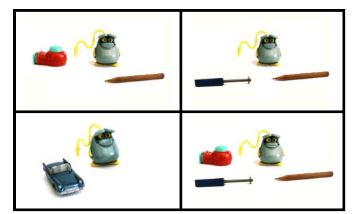
S2 : only compatible with inclusive interpretation of or (see last picture: A and B and C)

Please note that the only crucial difference between the two scenarios is represented by the last picture in the sequence (remember that, during the experiment, the order of presentation of the four pictures was completely randomized across items and subjects). Crucially, scenario S1 compatible with the exclusive is only interpretation of or, which is the most informative in case of sentences of type (b), i.e. in a NON-DE context, but not of sentences of type (a), i.e. in a DE context. On the contrary, scenario S2 is only compatible with the inclusive interpretation of or, which is the most informative in case of sentences of type (a) but not of sentences of type (b).